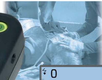
Chest compression depth gauge